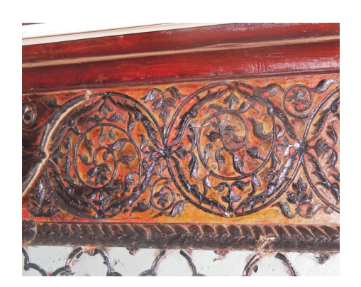
3. Wood work, Patvardhan Vada, Miraj