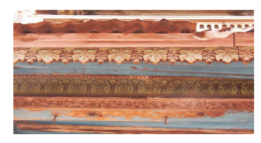
6. Pavilion Building, Khatib Well, Miraj