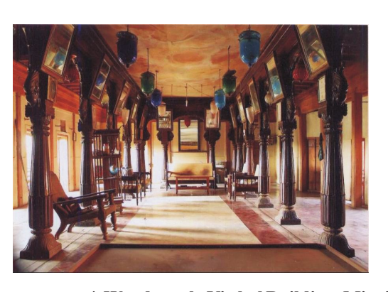
4. Wood-work, Vitthal Building, Miraj